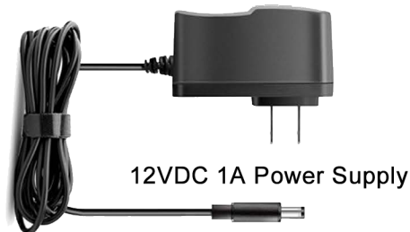
12VDC 1A Power Supply